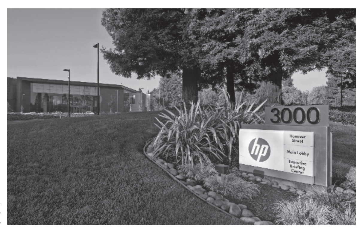
The HPheadauarter in Palo Alto

world. For the establishment of the Cyber Defense Centre, HP relied on the know-how of ConSecur selection and training of IT security analysts in a 15-months project.